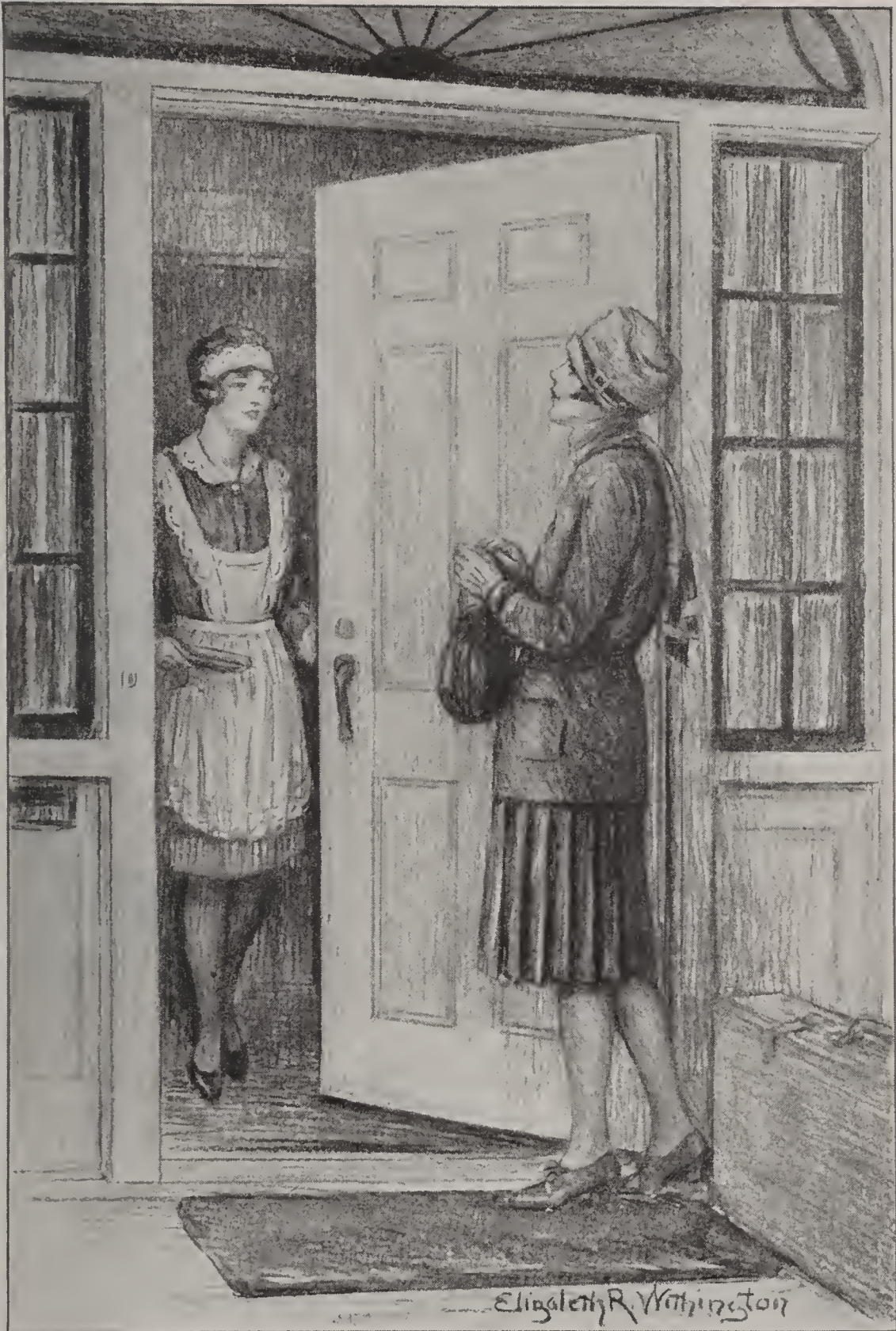
A SMARTLY-DRESSED MAID ANSWERED HER RING. — Page 54.